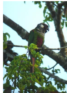
Gray-breasted Parakeet By Guide: Lelis Navarrete

Dec 17. In the morning we stayed in the grounds and trails close to our hotel, then the remaining time of the morning was dedicated to search the grounds of a much bigger Hotel, the afternoon was dedicated to study and enjoy great views of the critically endangered Gray-breasted Parakeet, some of the highlights for the day were: Laughing Falcon, Yellow-chevroned Parakeet, Ruby-topaz Hummingbird, Gould's Toucanet, Ocraceous Piculet, Little Woodpecker, Wing-banded Hornero, Pale-legged Hornero, Rufous-capped Spinetail, Ochre-cheeked Spinetail, Gray-headed Spinetail, Great Antshrike, Short-tailed Antthrush, Rufous Gnateater (ssp cearae), Buff-breasted Tody-Tyrant, Band-tailed Mankin, Orange-headed Tanager, Red-necked Tanager (ssp cearensis) and Pectoral Sparrow.