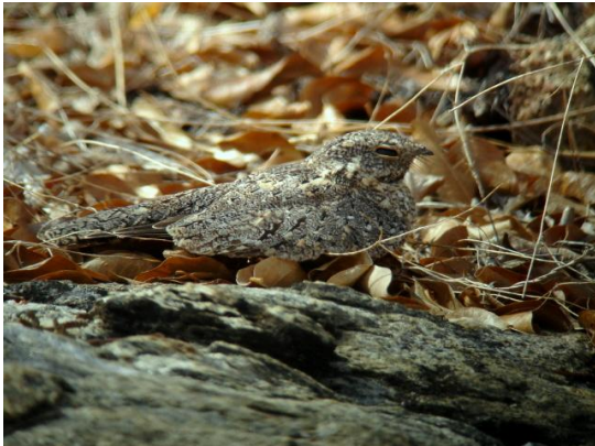
Pygmy Nightjar By Guide: Lelis Navarrete

Crato early enough to go and find our first male Araripe Manakin (One of the star birds of the trip). Night in Crato.