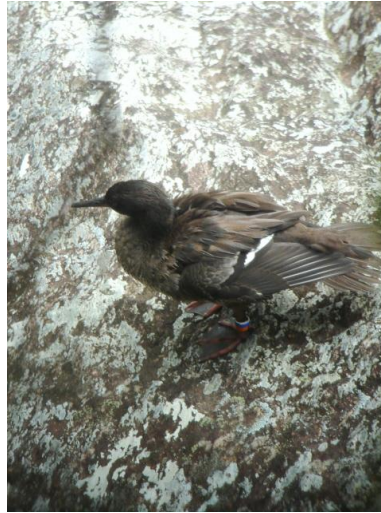
Brazilian Merganser